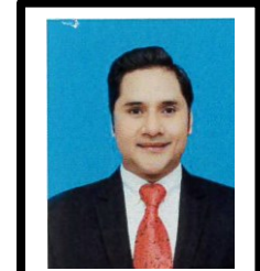
YBHG. DATO' BADRUL HANIF BIN AHMAD HADI (AHLI)